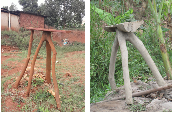
Image 1a und 1b: Two examples of ekimeeza.

in May 2016, my students quickly pointed out that there were numerous possibilities for them to intervene in the design and use of the space. So with the agreement of the head teacher, some of the students began to make regular visits to the school, and to tailor their semester's coursework for possible application in the kindergarten.