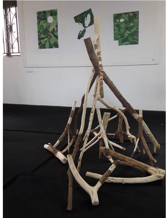
Image 2: The ekimeeza inspired installation. by Benjamin Eletu, 2018.

I had also been concerned by the storybooks that the students had created during the previous semester for the pupils at the kindergarten. I was happy with the quality of their books' designs, but worried by the fact that the stories they contained had simply been cut and pasted from other books. My students were not putting things in their own words. Therefore, I decided that for the upcoming publication design module, the students'