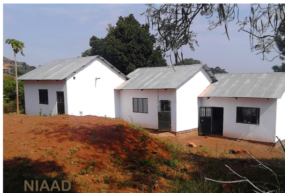
Image 3. Nazareth Community Kindergarten

and concerns about the education they were receiving about the challenges that they were facing, and their thoughts about their future.